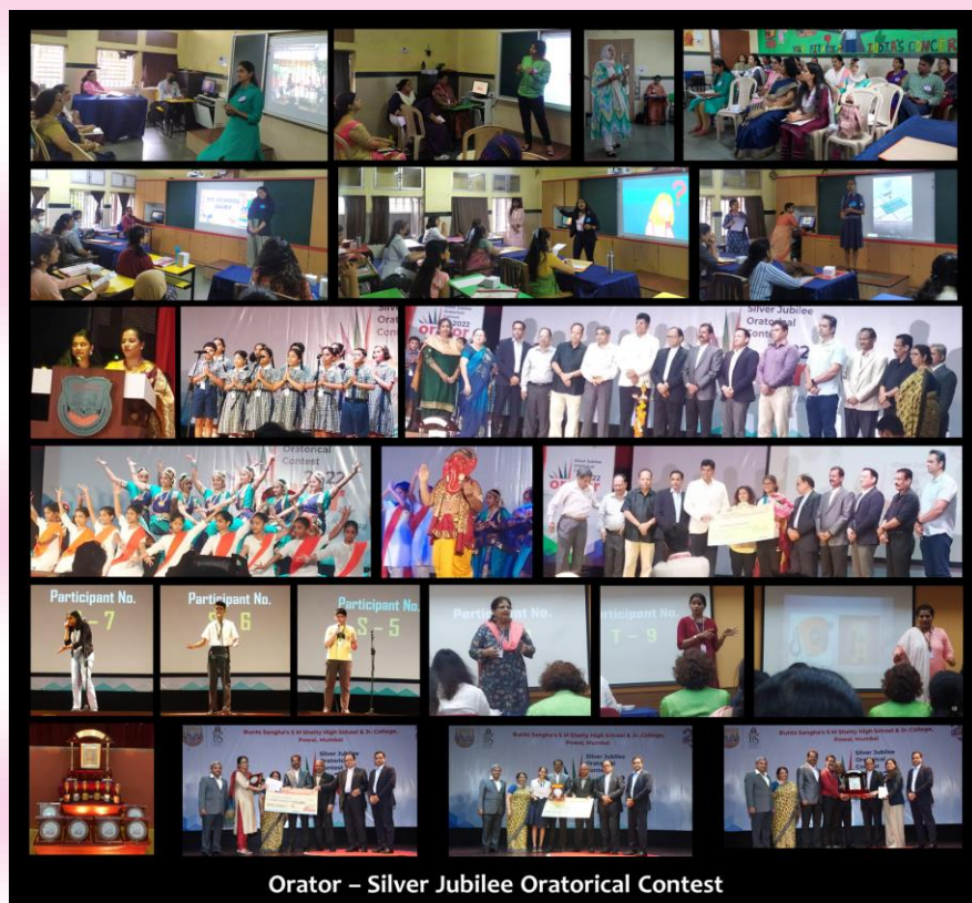
Orator – Silver Jubilee Oratorical Contest