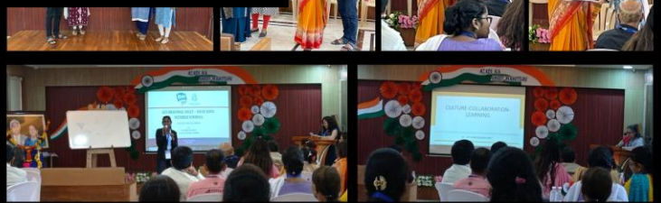
AFS Regional Meet - West Zone Member Schools

The teachers and students of our school participated in an ACS fest ' HOP - High on Passion ' which consisted of many interesting and captivating competitions on 10th August at Pragnya Bodhini High School, Goregaon East.