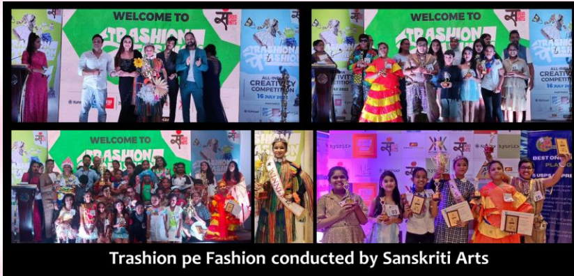
Trashion pe Fashion conducted by Sanskriti Arts

We achieved outstanding success as well as the Best School Award at the Trashion pe Fashion competition organized by Sanskriti Arts at Hotel Kohinoor Continental on 16th July. The competition aimed at converting trash into an artful piece with which one could walk the ramp and through the proceeds received for the competition each child would be helping to provide one girl child with her menstrual needs.