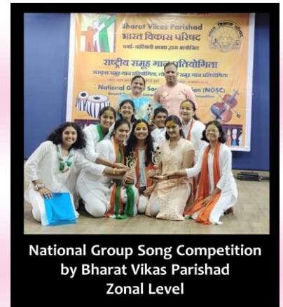
National Group Song Competition by Bharat Vikas Parishad Zonal Level

The school choir won first place in Folk music, first place in Sanskrit music and second place in Hindi music at the Zonal level of the National Group Song Competition conducted by Bharat Vikas Parishad on 7th August.