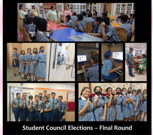
Student Council Elections – Final Round

from Std VI - X on 14th July followed by elections carried out through Google Forms on 15th July during school hours. The results of the election round were announced on 18th July. House Captains and Deputy Captains were elected by students of Std VIII & IX on 18th July during the House Meeting.