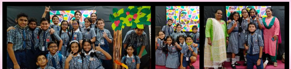
ACS fest 'HOP - High on Passion'

The month ended on a high note with new horizons being explored and new initiatives being taken.