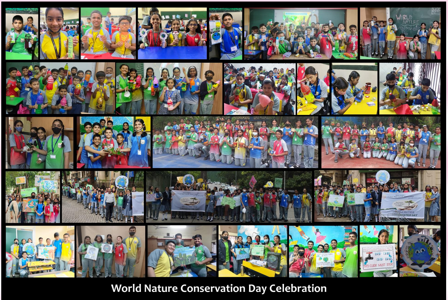
World Nature Conservation Day Celebration